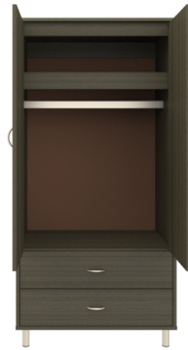
Model: A2WR22 34.75W 23D 71H

Taking on a new twist from an old classic, the Atlanta II re-invents itself by adding feet for a wonderful new design with tried and true appeal. Cleaning and maintenance are simple and easy when case goods are elevated. Available with or without contrasting edges as well as custom color combinations. The product is required to be wall mounted for safety. Using the kit provided, please follow provided instructions exactly.